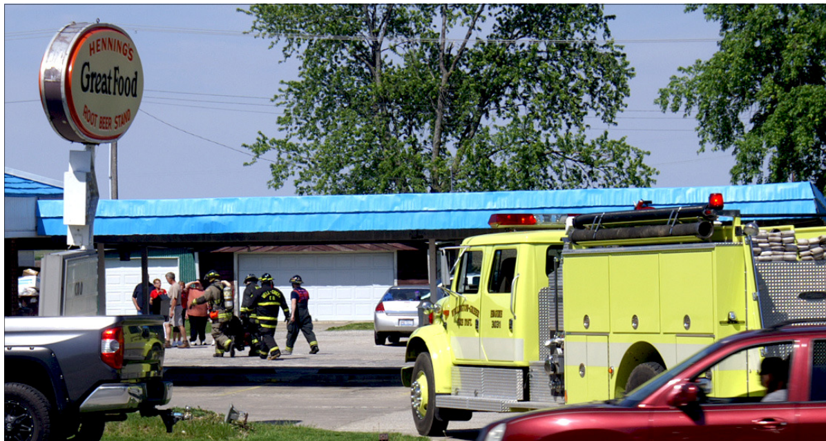
As Wellington firemen enter the building, employees and patrons of Henning's stand outside after a fire Friday.