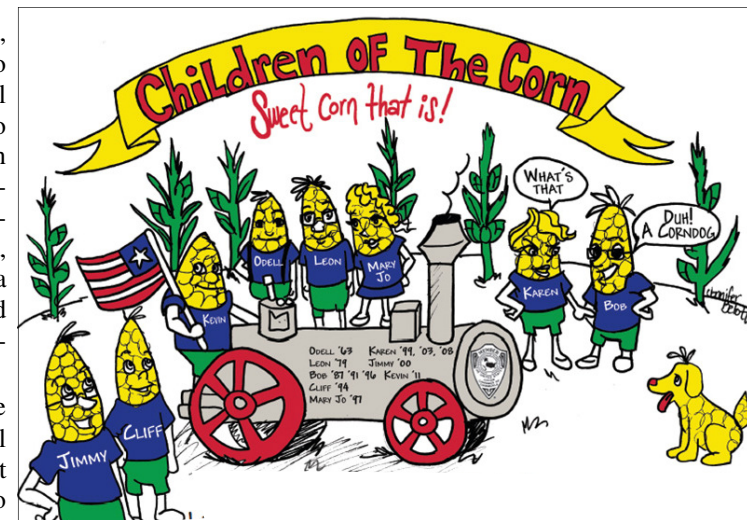
This year's National Sweetcorn Festival logo, "Children of the Corn," pays homage to the familial history of some Hoopeston Jaycees, whose parents were also instrumental in the festival.