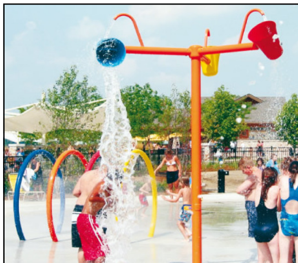
Hoopeston officials are being asked to consider changing the kiddy pool to a splash pad area such as that pictured.