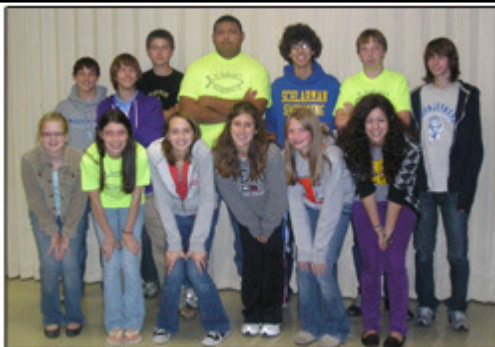
St. Anthony Parish Youth Group and Friends