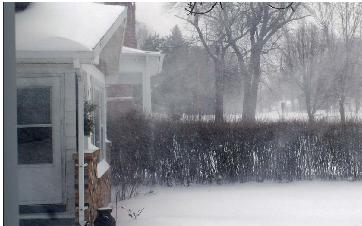
High winds blow snow from rooftops Tuesday in the 400 block of East Seminary.

The National Weather Service is predicting another chance of snow Friday night and Saturday.