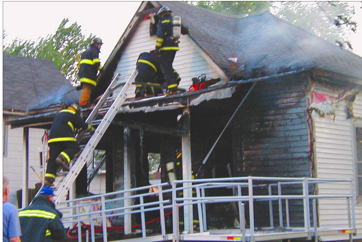
Hoopeston firemen fight a house fire at 705 S. Second Ave. Thursday evening.

Firemen worked for more than an hour on fighting the