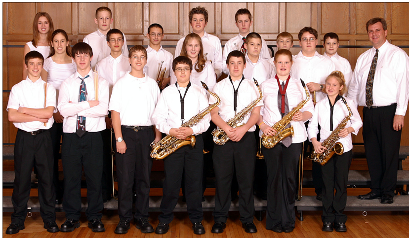
Hoopeston Area High School and Middle School Jazz Ensembles