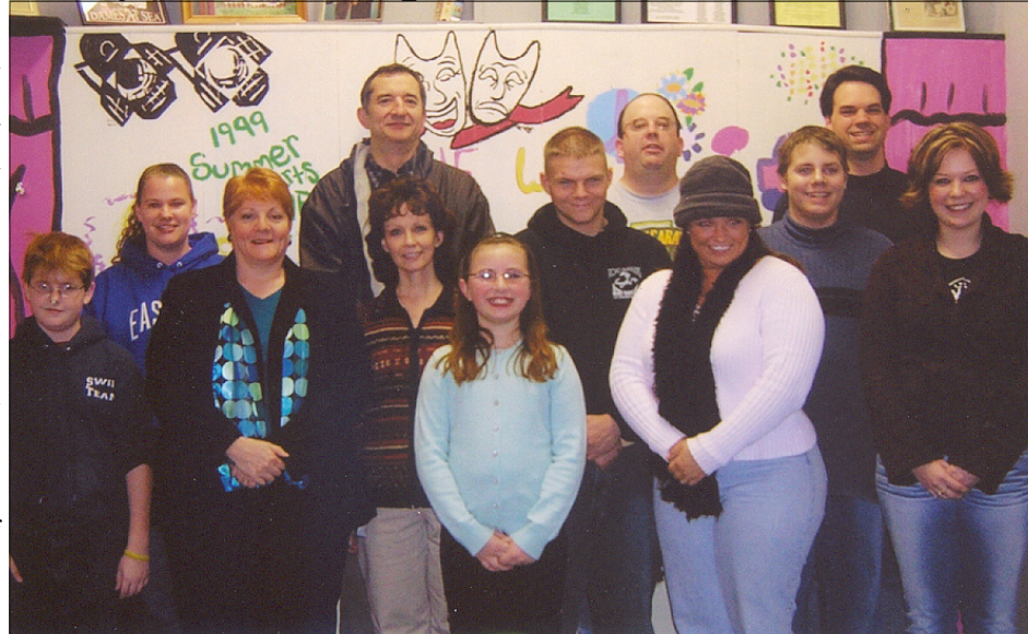
The cast of "Our Town"

General admission tickets are $8 per person. Subscriptions for the 2005 season, including productions of "Our Town," "Grease," and "Joseph and the Amazing Technicolor Dreamcoat" are avail-