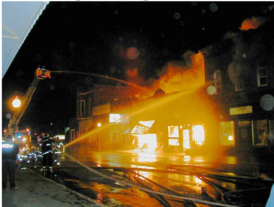
On Feb. 27, members of the Rossville Fire Department battled a nearly block-long blaze on South Chicago St. The fire is this year's top local news story.

This year's other stop stories include: 2.) After going more than 30 years without asking for