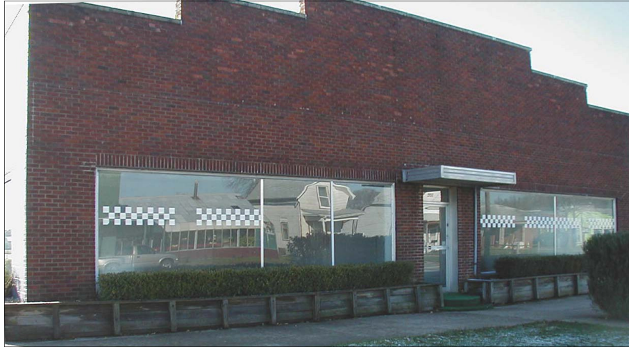
The former Burton Motors building at 701 W. Main, has a new owner and is undergoing repairs. It will initially be used for storage for a Lockport business.