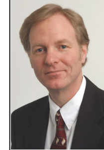
Paid political ad

Do you think it's time we got tougher on meth and other crimes that destroy our communities?