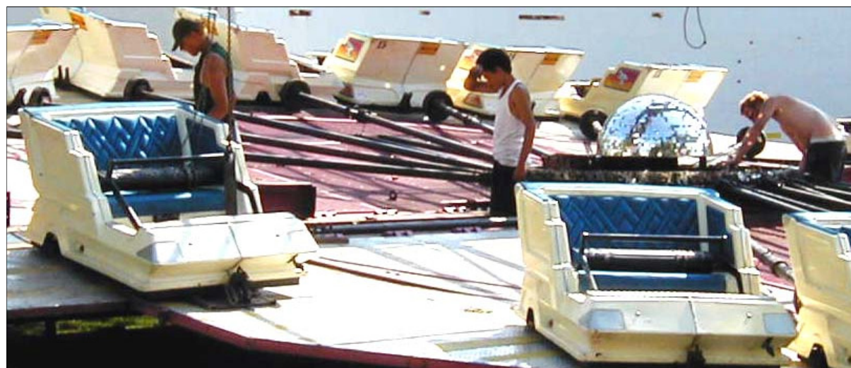
Workers with Amusements ready the Himalaya, one of the rides at the carnival during the National Sweetcorn Festival. The event runs Thursday through Monday at McFerren Park.