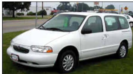
2000 Mercury Villager GS