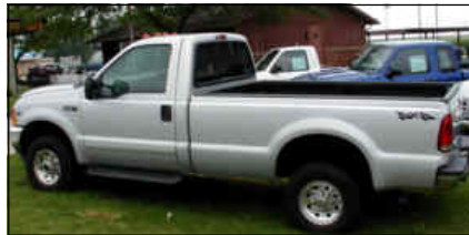
2001 Ford F250 XLT