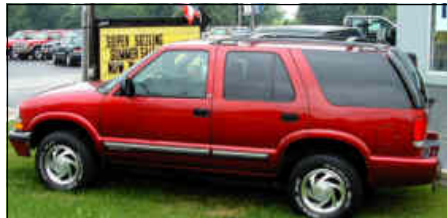
2000 Chevrolet Blazer LS