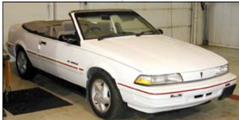
1993 Pontiac Sunbird SE