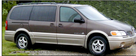
2000 Pontiac Montana