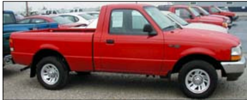
1995 Ford Ranger XLT 4x2