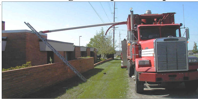
A truck owned by R.K. Hydrovac contains polyurethane material for a new roof at Hoopeston Community Memorial Hospital and Nursing Home. Roof repairs led to flooding at the hospital Sunday.

A damage estimate was not available Monday but is