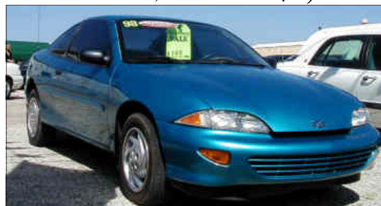
1998 Cavalier Low miles Auto/Air was $6,900. Sale price $4,800