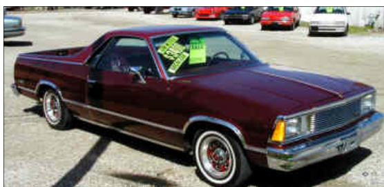
1981 El Camino