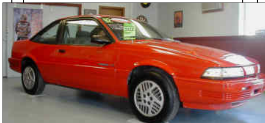
1992 Sunbird Coupe Red $3,500