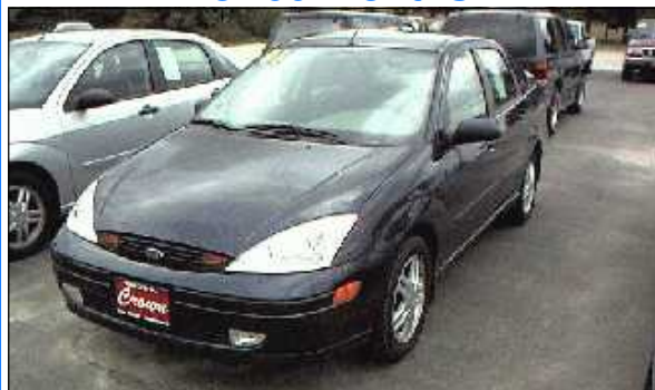
2001 Ford Focus $11,995 24010AA