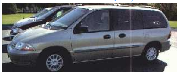
1999 Ford Windstar LX $12,995