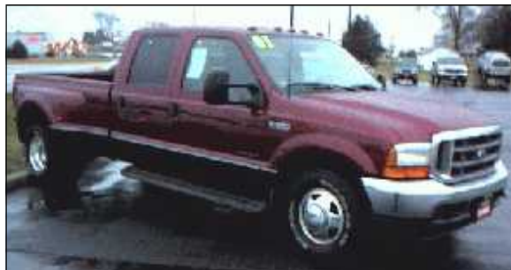
2001 F350 4x2 Diesel 2615A