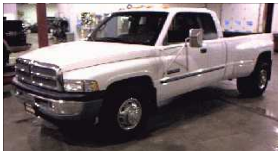
2000 Ram 3500 4x2 Diesel P1624

FOR A COMPLETE INVENTORY, GO TO OUR WEBSITE AT www.crown-ford.com Crown Ford-Mercury, Inc., will not honor pricing errors in this advertisement.