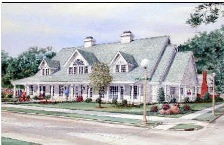
An artist rendition of the Carle Auxiliary Guest House in Urbana. A Rossville man was the first guest at the house.

Designed to blend into the neighborhood setting, the Guest House has 12 bedrooms, two of which are ADA compliant, all with private baths; a living room, TV