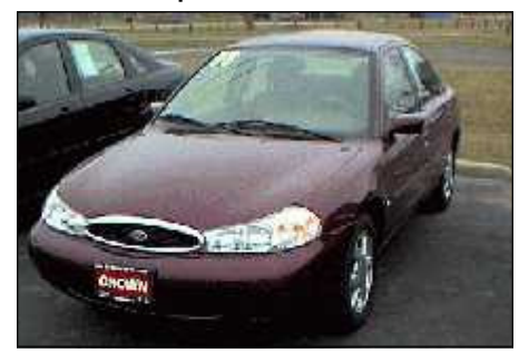
1998 Ford Contour $111<sup>00</sup>/mo. P1550A

FOR A COMPLETE INVENTORY, GO TO OUR WEBSITE AT www.crown-ford.com