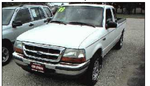
1998 Ford Ranger $145<sup>00</sup>/mo. 23403B