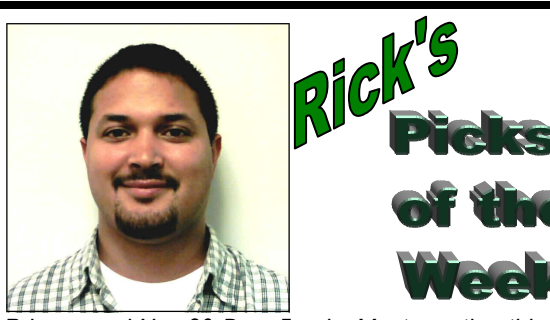
Prices good Nov.29-Dec. 5 only. Must mention this ad.