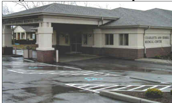
The Charlotte Ann Russell Medical Center

How people receive health care is changing. Technological and medical advancements allow primary care physicians and specialists to provide care and do procedures in outpatient clinics that were once only done in hospitals. The demand for primary health care services is also increasing. As a nation and a community, we are growing older and living longer